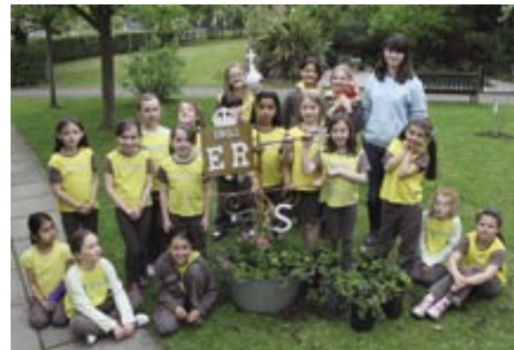
The 7th Frimley Brownies design 'Weather Permitting' uses a weather vane from the old Heathcote School and a dying tub sourced at a car boot sale planted with a range of plants including petunias and marigolds.